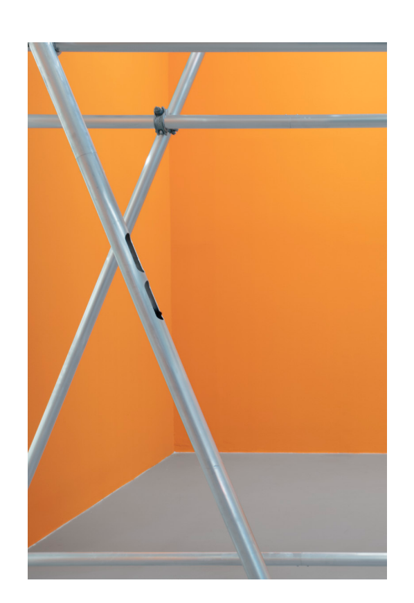
In Ià (detail), 2022