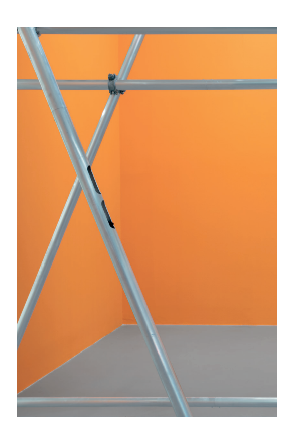
In Ià (detail), 2022